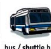
bus / shuttle bus /'ʃʌtl/