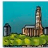
church / cathedral /kə'thi:dərəl/