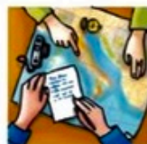
work out / plan a trip