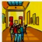
visit / hit a spot